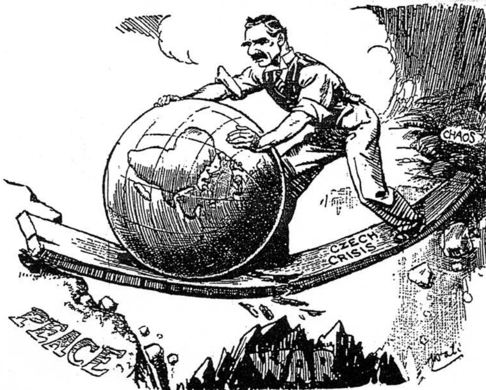
A cartoon published in a British newspaper on 25 September 1938. The man in the cartoon is Chamberlain.