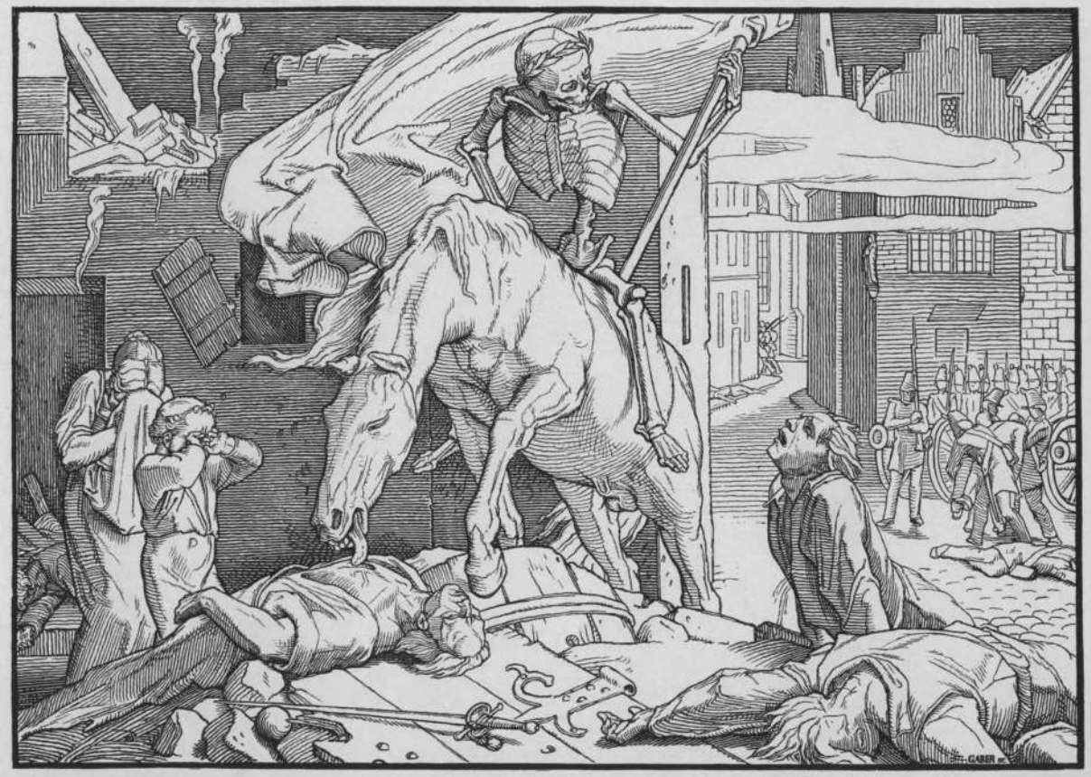
A drawing, from the time, of the disturbances in Berlin. It is entitled 'The Dance of Death, 1848'.